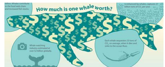
The IMF turns whales into carbon offset dollars

The United Nations, the International Monetary Fund, 41 countries and conservation NGOs are turning whales into carbon offsets for greenwash . 33 Using whales to pretend to absorb carbon dioxide is a false solution to climate change that could accelerate the extinction of whales . The IMF wants to pay the oil, fishing, and shipping industries not to kill whales so they can use them as carbon credits, even though these same industries also pollute and cause climate change , which in turn kills whales . 34